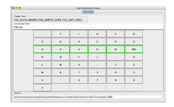
figure 1. Screen shot of a TCF where the selectables are arranged by unigram probabilities and are highlighted in rows and columns.

of symbols (such as letters, digits, the space character, and punctuation marks) and system commands , arranged and displayed on a display and highlighted in a specific order. Together with an often customizable input mechanism or input action , such as a puff switch or a single button, soft keyboards form an indirect text composition facility (TCF). The user can select a highlighted selectable or group of selectables by activating the input action. These systems thus afford an effective method for text composition for people with disabilities and have been in use for many decades [3, 4]. Figure 1 shows a soft keyboard.